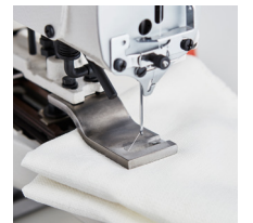
HEAVY-DUTY TACK PLATE