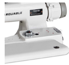
REMOVABLE SWING ARM