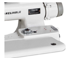
REMOVABLE SWING ARM