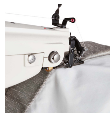
PLUNGER DROP FOR PRECISE STITCH DEPTH