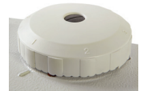
UPPER FEED ADJUSTMENT