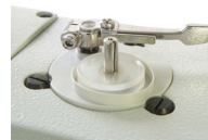
BUILT-IN BOBBIN WINDER