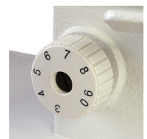
STITCH DIAL REGULATOR