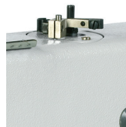
BUILT-IN BOBBIN WINDER