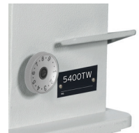
STITCH DIAL & REVERSE LEVER