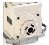
DIRECT DRIVE MOTOR