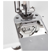
VERTICAL BOBBIN LOAD